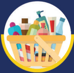
Cosmetics & Personal care

While thriving to expand our scope of operation to provide conformity assessment for products from outside Omani market, we proactively support Omani product export to the world, by providing pre-shipment certificates for major Omani industries such as;