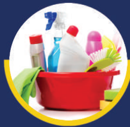
Dishes wash & House cleaning